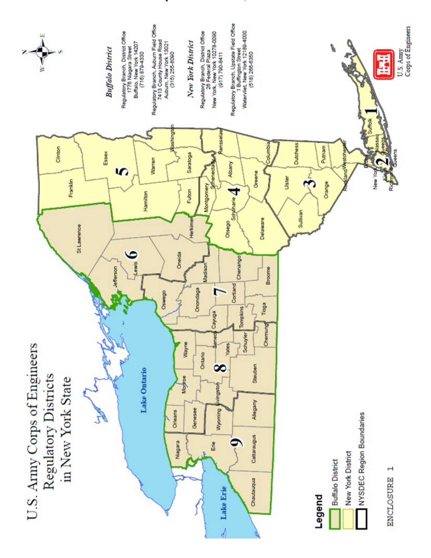
Buffalo & New York Districts Final Regional Conditions, Water Quality Certification and Coastal Zone Concurrence for the 2021 Nationwide Permits for New York State Expiration March 14, 2026